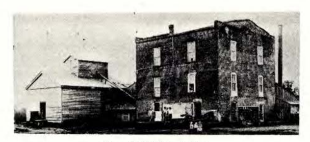
Mansfeild Mill, 1860