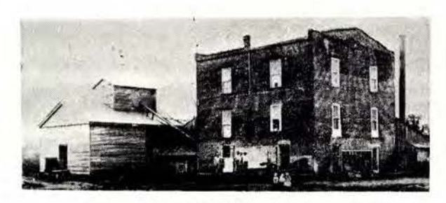
Mansfeild Mill, 1860