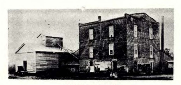
Mansfeild Mill, 1860