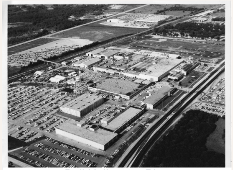
Bell Helicopter Plant

Throughout the 1930s and 1940s, a handful of grocery stores, filling stations, and cafes opened, and the Work Projects Administration erected a brick school in 1940. However, it wasn't until 1951, when Bell Helicopter opened a $3 million plant in Hurst, that the area experienced a significant boom in growth. Hurst was incorporated as a general law city on September 25, 1952, with a total population of 2,700. During the next five years, the population increased to 5,700. By the mid-60s, it had climbed to more than 20,000.