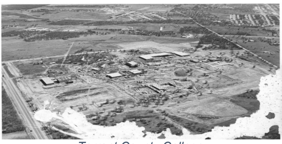
Tarrant County College Northeast Campus Construction

Other significant developments followed, including the opening