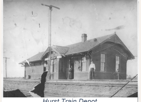
Hurst Train Depot

The area began to grow slowly after the Civil War, but it was when the Rock Island line was built in 1903