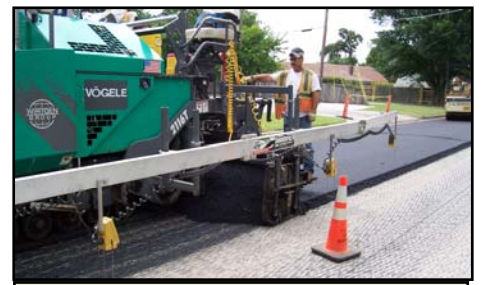
Precinct 3 crew placing asphalt on Brown Trail in Bedford

Right-of-way mowing will continue throughout the summer in unincorporated areas.