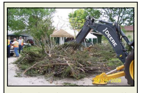
Precinct 3 Maintenance crew working with the City of Hurst and limb cleanup on Elm Street caused by April 10th storm.

Precinct 3 Maintenance News 817-514-5000