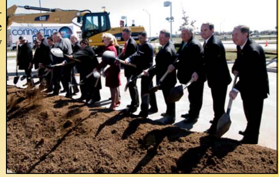
DFW Connector Groundbreaking

February 17, 2010 was a significant day for the DFW Connector, the project officially broke ground. At the peak of construction, the DFW Connector will create over 600 local jobs, and many more will be generated that are directly and indirectly linked to the construction.