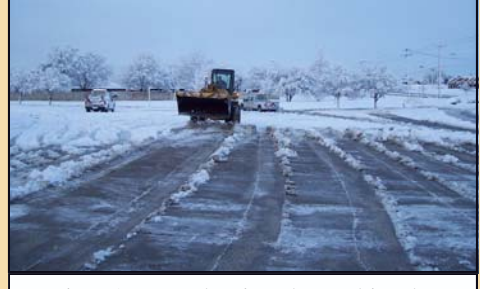
Precinct 3 crew clearing the parking lot at the Northeast Sub-Courthouse.

with training he received through participation in his local volunteer fire department immediately stepped up and took preventive action until the ambulance arrived. The right person was there at the right time and our injured staff member has fully recovered.