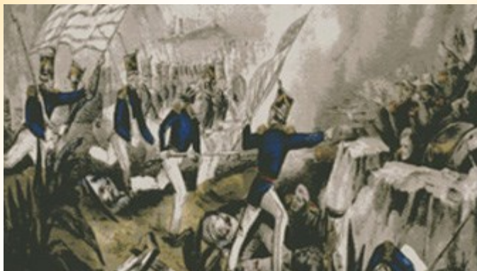
Mexican-American War battle scene

Answer: It was not resolved until the Treaty of Guadalupe Hidalgo was signed after the Mexican-American War in 1848.