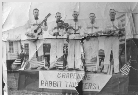
Grapevine Rabbit Twisters, photograph Date Unknown