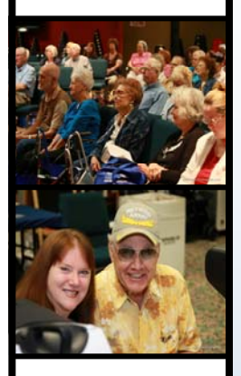
"Great speakers! Enjoyed every minute!"