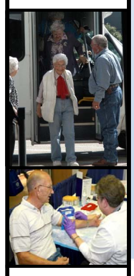
"Excellent attendance! We loved being a part of it!."