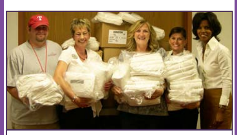
The Mid-Cities Supporters - SOS Group (pictured) makes a laundry donation to SafeHaven.

For immediate assistance regarding domestic violence, please contact the 24 hour toll free crisis hotline at 1-877-701-SAFE (7233).