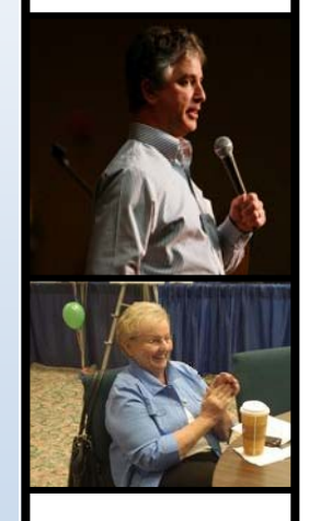
"Hospital screenings were wonderful! Great job by all!"