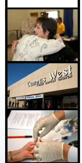
"Looking forward to next year!"

Save the date >>> The 3rd Annual Empowering Seniors on October 7, 2011!