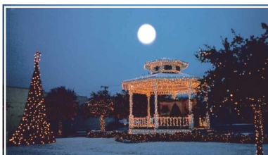
Main Street Gazebo, Grapevine