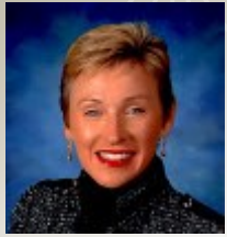
Mayor Laura Wheat