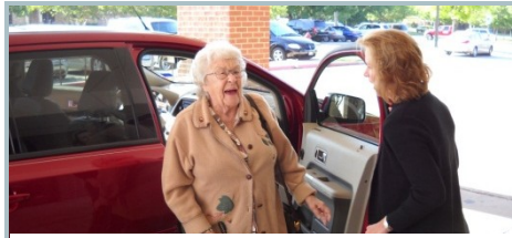
Reward – a smile that lasts for miles

Mid-Cities Care Corps (MCCC) is a non-profit 501 (3)(c) established in 1981 with a mission "to preserve the independence of senior neighbors in N. E. Tarrant County". All services are provided by caring volunteers. Anyone with three hours a month to spare is a candidate to be a MCCC volunteer with flexible opportunities that are respectful of one's personal schedule.