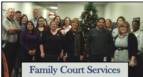
Family Court Services

www.tarrantcounty.com/edro/site/default.asp