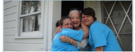
Priceless reward for a Helping Hand genuine THANK YOU & occasional HUG!

Services are provided by caring volunteers from faith based communities, youth groups, businesses, and friends who want to make a difference in the lives of seniors in the area. Last year MCCC volunteers drove 28,726 miles providing these MCCC services.