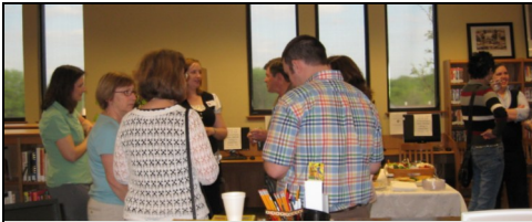
Gallery Night - Historical photos and articles about Haslet are shared.

Haslet Public Library began with the founding of the Friends of the Library in August 2004. The dedicated members of this organization energized the community to open a volunteer-staffed library in February 2005. It was housed within the 900 square foot Haslet Bank Building, the only historic building in the city. Later that same year, the city leaders supported this new venture and recognized its valuable contribution to the community by hiring the initial part-time librarian. In 2007 construction began on a new 3,600 square foot library which opened in January 2008. The library has grown from a small group of donated books to over 19,000 print, audio, electronic, and visual materials with