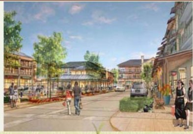
Plaza Green Perspective