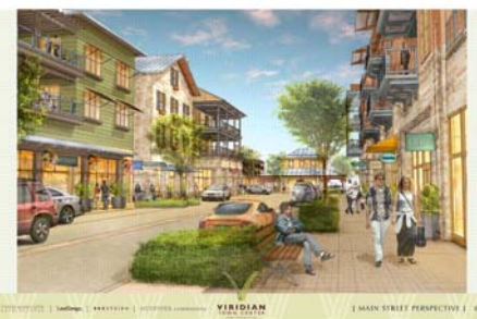
Main Street Perspective

Among the many amenities residents of this exciting new community will enjoy are more than 1,200 acres of protected wetlands and open spaces, a trail system with over 20 miles of trails along the Trinity River, and 450 acres of lakes. Viridian is planning more than 3,500 single-family homes, as well as 300,000 square feet of retail and 400,000 square feet