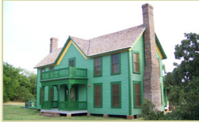
626 Ball Street in Grapevine