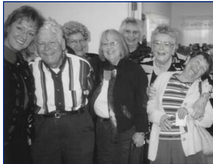
Haslet Senior Center Group

MMOW was born of neighbors taking care of neighbors in rural communities