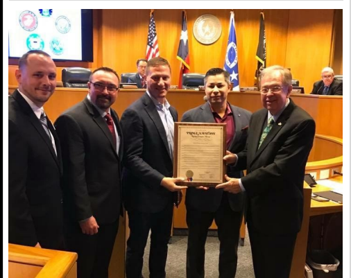
The Cowtown Warriors' were presented with a Proclamation for their efforts and Commissioners Court proclaimed the week of November 5-9, 2018 as National Veterans Awareness Week.

The event highlighted a shortfall in monetary support and other resources for North Texas veterans who served honorably but suffer from severe physical and psychological injuries related to their service. Thus, the decision was made to set up a unique 501(c)3 nonprofit in Fort Worth, Texas known as The Cowtown