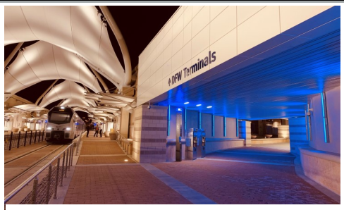
DFW Airport Terminal B Station

"We agree that extending the TEXRail route is a viable option to pursue," Ballard said. "The initial response indicates that the extension would be a popular option for medical employees to travel to work and for students to go to class."