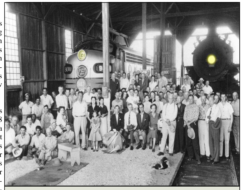
The Smithfield area flourished after the Cotton Belt Railroad arrived in 1887. Today, the City of North Richland Hills is working to bring a new commuter rail service to the community.

The railroad fare from Smithfield to Fort Worth was 35 cents and the trip took about an hour to cover the 18 or 19 miles in good weather. The train stopped twice a day, at 10:10 in the morning going southwest to Fort Worth and at 10:10 at night going to points east such as Plano and Greenville. The morning stop in particular attracted townsfolk who would gossip and collect news from the conductor. The railroad opened up potential for commercial development and in the late 1880s Smithfield received its first real industry - the Smithfield Canning Factory. The factory employed 20 to 30 women and children who canned tomatoes, corn, peaches and peas grown by area farmers.