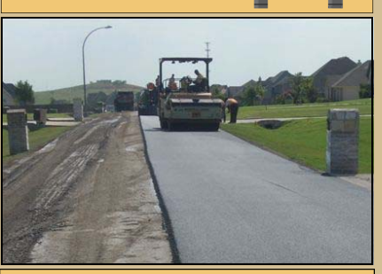
Rehabilitation of Lonesome Trail