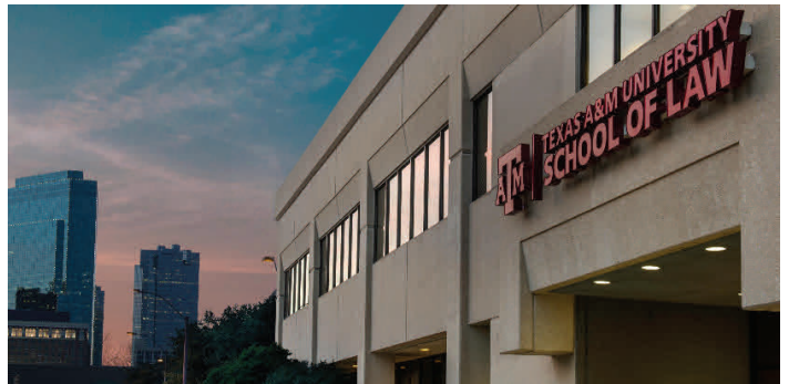
Texas A&M current law school building in downtown Fort Worth.

Plans call for a new law school building to be built on some