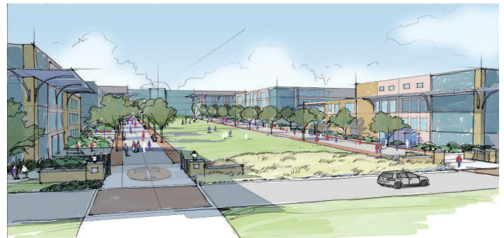
An artist's sketch of the planned Tarleton State University Fort Worth Campus

Some of the medical technology programs that the school offers will continue to be taught in the offices located in the Medical District and on Camp Bowie.