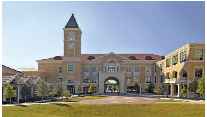
The clock tower on Brown-Lupton University Union at Texas Christian University. TCU and the University of North Texas Health Science Center are collaborating on a new medical school, one of several innovative higher education developments in Tarrant County.

Our colleges and universities deserve our full support. They step up and play a significant role helping Tarrant County and all of North Texas meet the changing demands of a dynamic 21 st century.