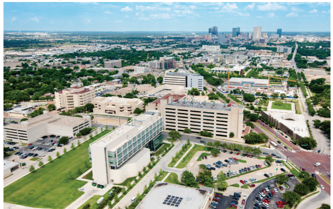
The UNT Health Science Center in Fort Worth where some of the classes for the new MD school will be held.

Leaders from the Health Science Center and TCU have formed committees to study curriculum, admissions and other educational issues. The curriculum, when it is developed, may require the hiring of new faculty, the officials said.