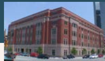
Family Law Center

2701 Kimbo Road, East Building Fort Worth, TX 76111