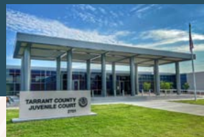
Scott D. Moore Juvenile Justice Center

100 N Calhoun Street Fort Worth, TX 76196