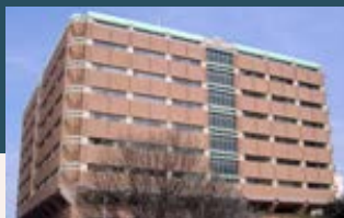
Tim Curry Criminal Justice Center

401 W Belknap Street Fort Worth, TX 76196