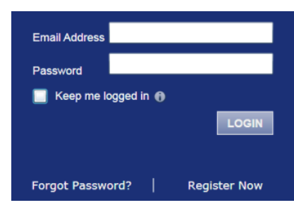
Figure 2.5 – eFileTexas.gov Login Area