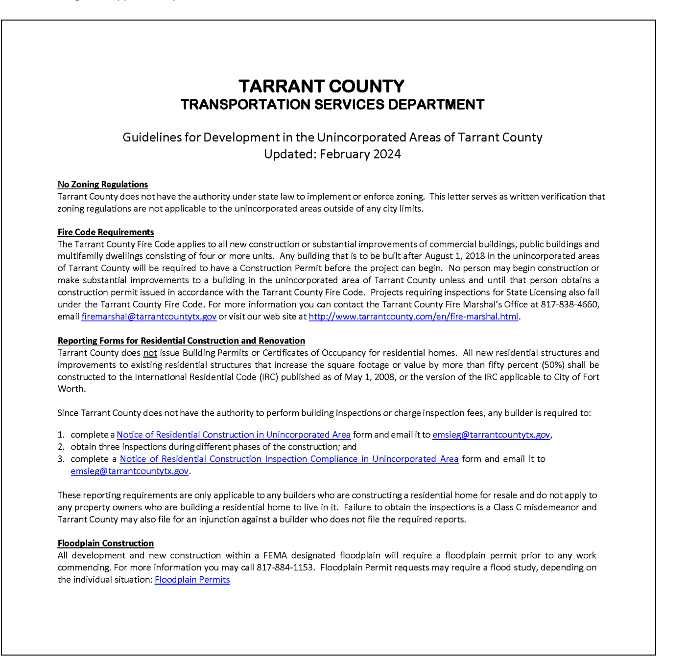
Figure 12: Guidelines for Development in Unincorporated Areas Template (Page 1 of 3)

The Department is authorized to establish, update, and maintain Development Guidelines in Unincorporated Areas. The following template is for informational purposes only. To view the current version of the Development Guidelines in Unincorporated Areas, applicants may either visit the County's website or contact The Department. The Department, at its discretion, may modify the Development Guidelines in Unincorporated Areas at any time to manage the application process.