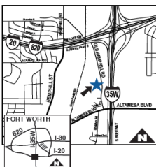
Drop-Off Station #3 6260 Old Hemphill Rd. 76134