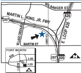
Drop-Off Station #2 5150 Martin Luther King Jr. Fwy 76119